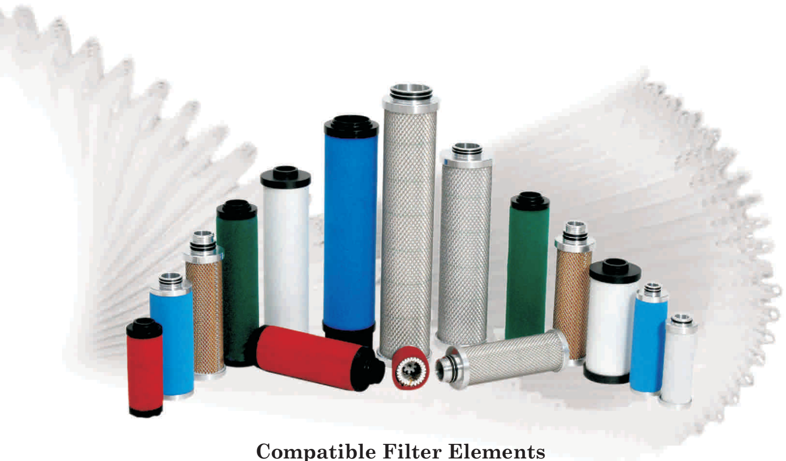
Compatible Filter Elements